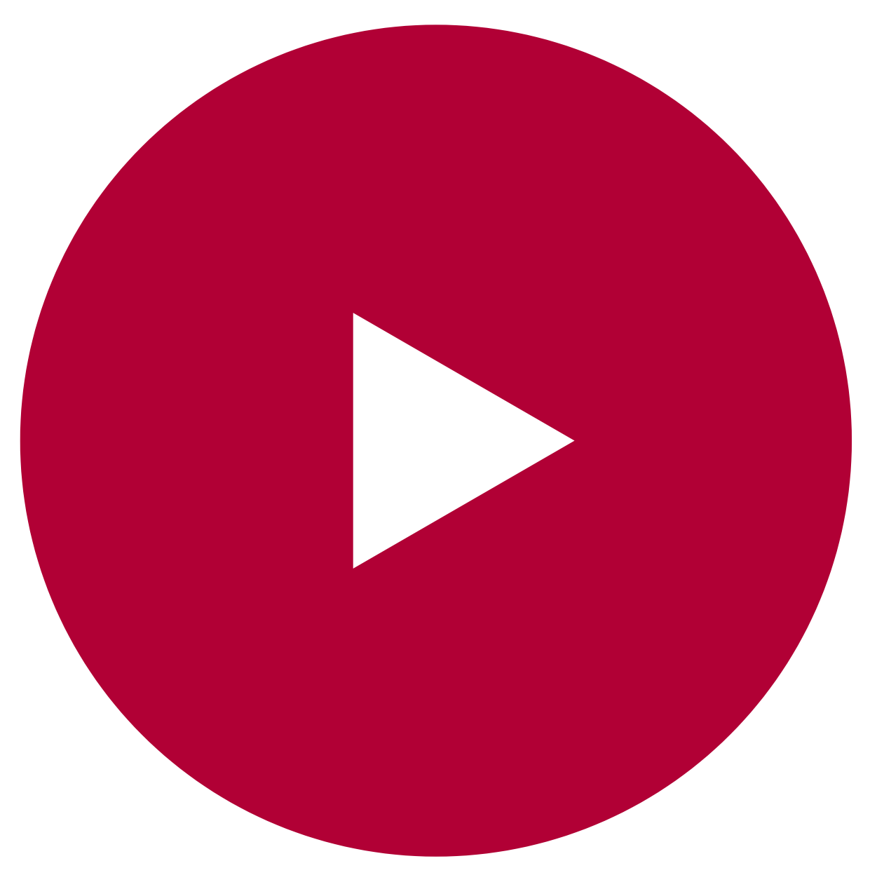
Al and tech: The evolving legal and regulatory environment