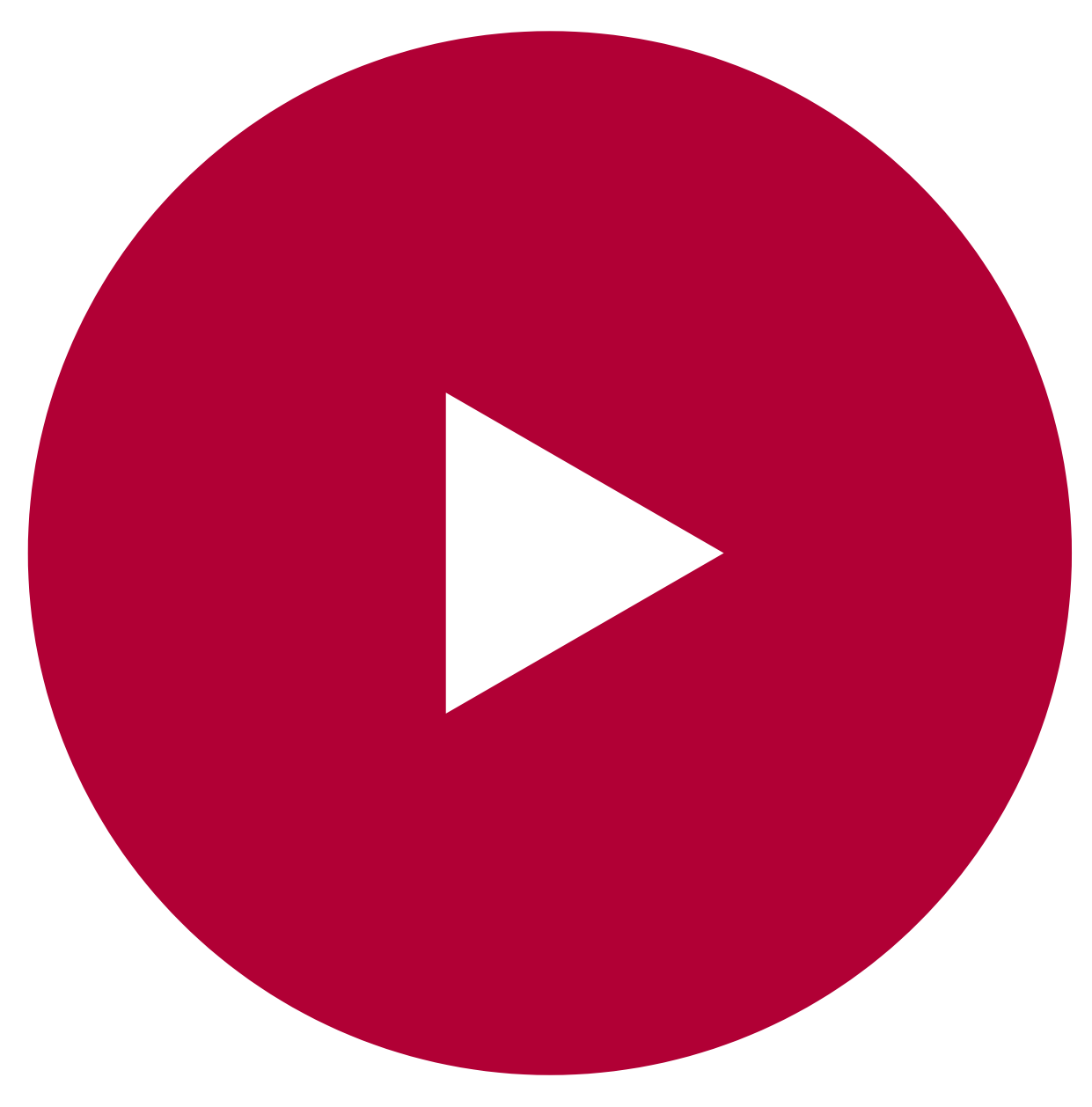
Choosing and using AI and technology in a law firm